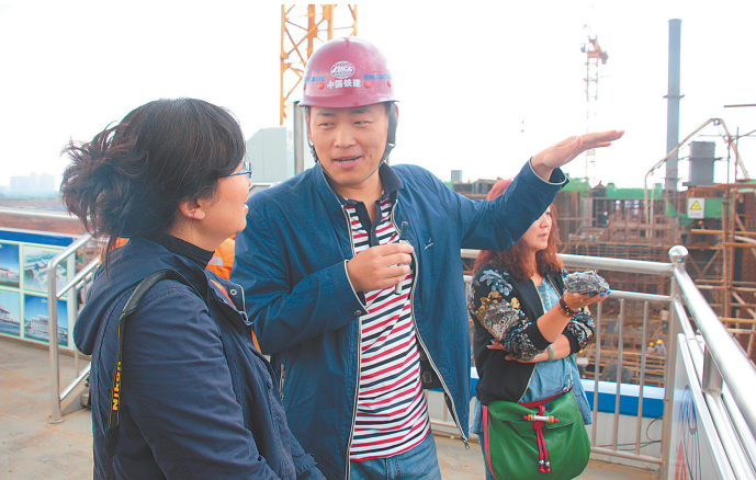
Person in charge of the construction is giving introduction to the railway station.