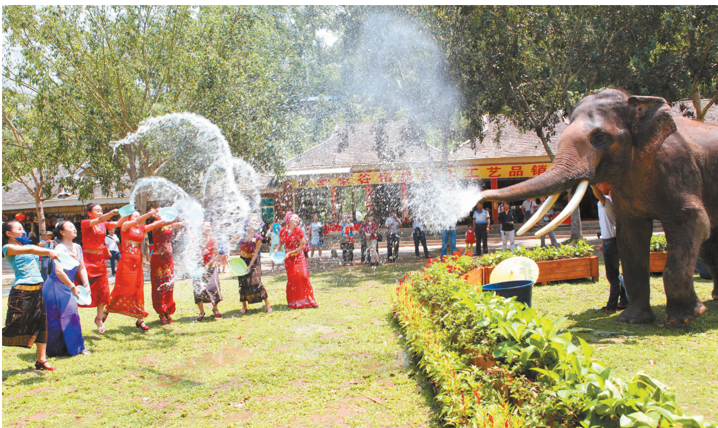
A water splashing war between people and elephants was staged in the Xishuangbanna Wild Elephant Valley Scenic Area, Yunnan on April 15 during the Water-Splashing Festival, which is celebrated in mid-April every year as a traditional festive occasion in Thailand, Cambodia, Myanmar and other Southeast Asian countries as well as in Yunnan and Guangxi of China. People splash water on each other to exchange best wishes and express their joy.

cooperation agreement with Federation of Indian Export Organizations and India Chamber of Commerce concerning the organization of the 3 rd China-South Asia Expo; China Tobacco Yunnan Industrial Co., Ltd. and Yuntianhua Group also signed strategic trade cooperation agreements with two Indian companies respectively, involving 300 million US dollars.