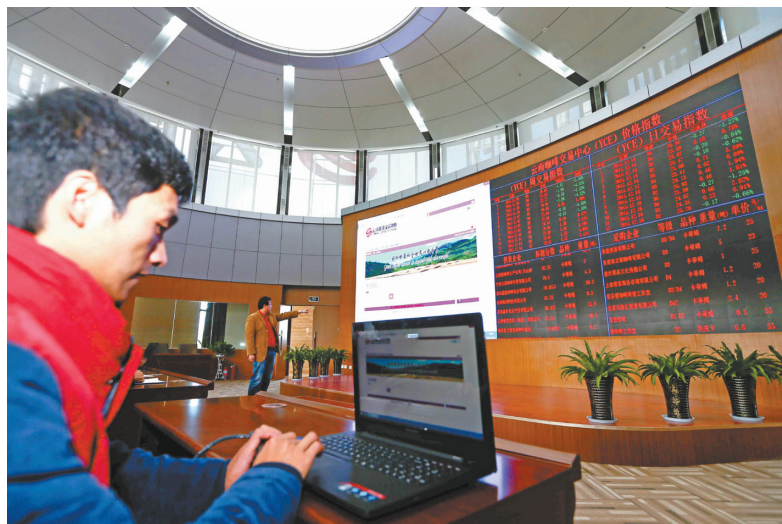
Yunnan coffee trade center was launched online trading in Pu'er.

In the morning of January 12, commencement ceremony of Yunnan Choice Coffee Processing Park was held in