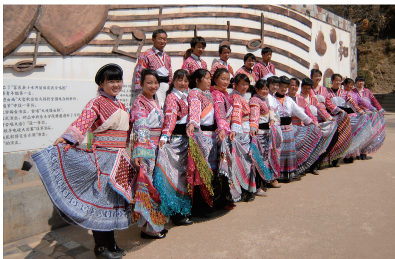
The member of the choir is taking rehearsal.