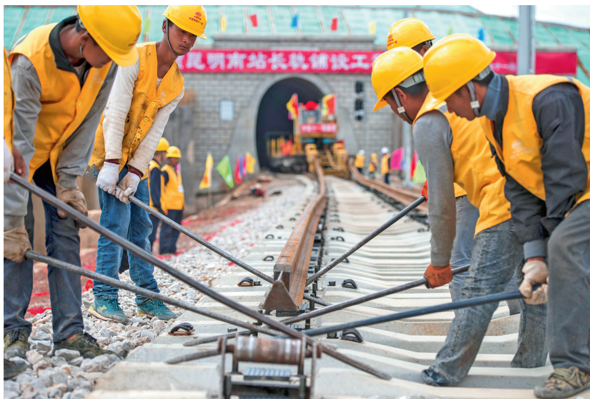
Track-laying is completed in Kunming South Station of Shanghai-Kunming High-Speed Railway which will be put into use at the end of this year. In this photo, workers are laying the last tracks.