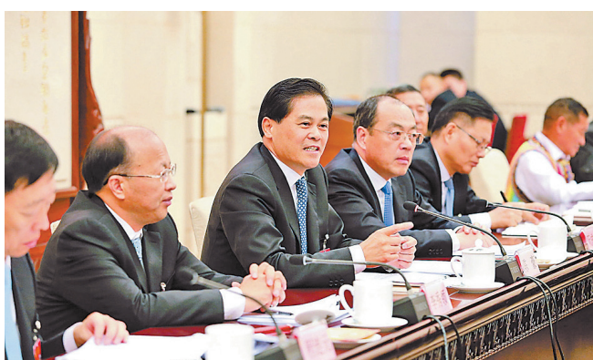
Yunnan delegation is answering questions from the media.