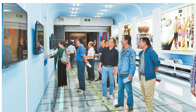
Citizens visit the exhibition of the Yunnan achievements.

As Yunnan continues to speed up the pace as a pivot of China's opening up to South and Southeast Asia, international