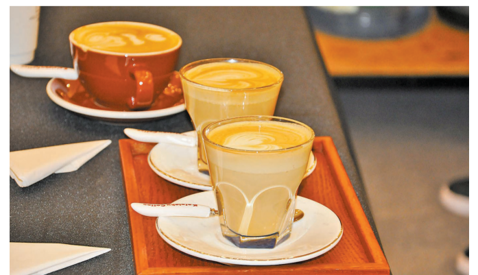
Coffee works made by contestants at the recent Kunming Baristas Vocational-Skills Competition.