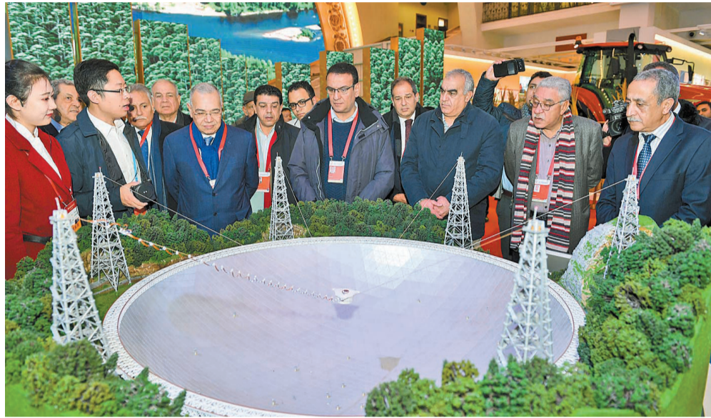
Overseas political parties' leaders visit a exhibition regarding China's achievements in the past five years in Beijing.

The views were shared by the many representatives during the discussions, which focused on the responsibilities of political parties in building a com-