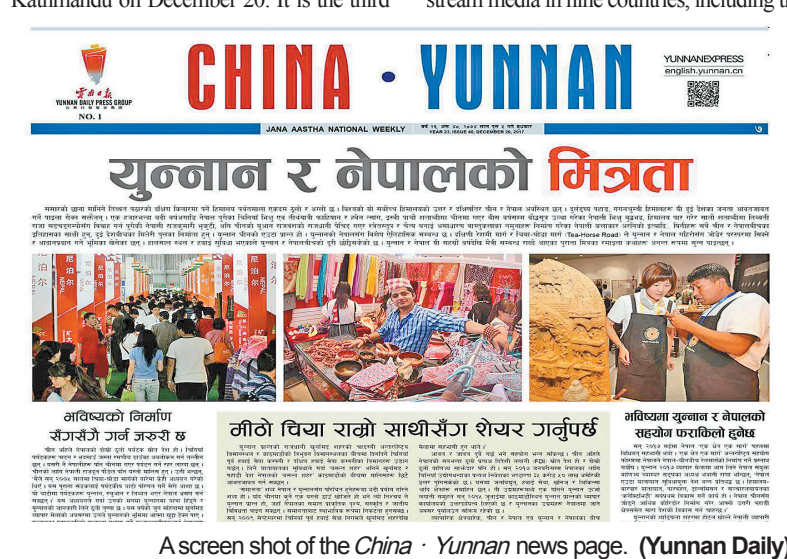
A screen shot of the China • Yunnan news page.

As a page of the Jana Aastha National Weekly , the China•Yunnan news page will be published on a monthly basis. It will focus on Yunnan-Nepal cooperation in fields of people-to-people exchange, culture, education, art, religion under the framework of Belt and Road Initiative, so as to deepen mutual understanding, promote socio-economic development in Nepal and Yunnan, and enhance China-Nepal friendship.