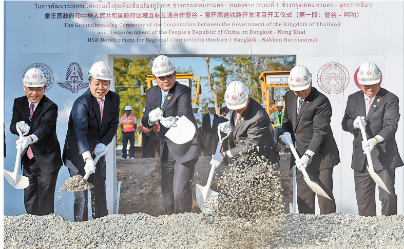
Thai Prime Minister Prayuth (3rd, L) attended the foundation-laying ceremony.

On Nov 24, Thai Transport Minister Arkhom Tempittayapaisith said the construction of the remaining 249 km would start gradually after being