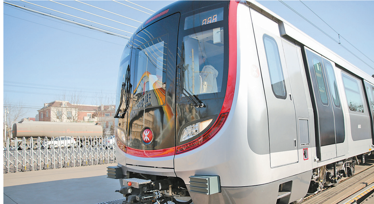
On December 21, the first metro vehicle developed for Hong Kong by CRRC Qingdao Sifang Locomotive and Rolling Stock rolled off the assembly line. It is the first train built by China's largest metro vehicle project, and is also built to the highest ever fire safety ratings in the world. The picture shows the first metro train developed by Qingdao Sifang rolling off the assembly line for use in the Hong Kong downtown area.