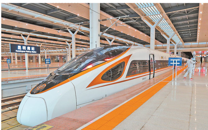
A Fuxing bullet train departs from Kunming for Shanghai on December 28, 2017.

At 8:14 am on December 28, 2017, the bullet train G1372 connecting Kunming and Shanghai slowly pulled out of the platform from Kunmingnan Railway Station. This marked the debut of the Fuxing electric multiple unit (EMU) train in Yunnan. It was