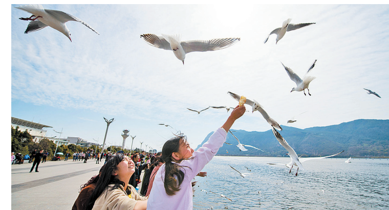
Tourists are feeding seagulls at Haigeng Dyke of Dianchi Lake, Kunming.

Yunnan's tourism industry generated an income of 19.293 billion yuan – about three billion U.S. dollars – during the week-long Spring Festival. The total represents a year-on-year increase of 42.35 percent.