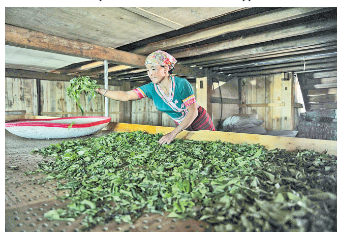
A villager in Jingmai Mountain is making tea. Online photo

To further preserve the tea groves, the shabby houses of local ethnic folks need to be renovated, while maintaining their original architectural style cultural landscape," a worker with the preservation