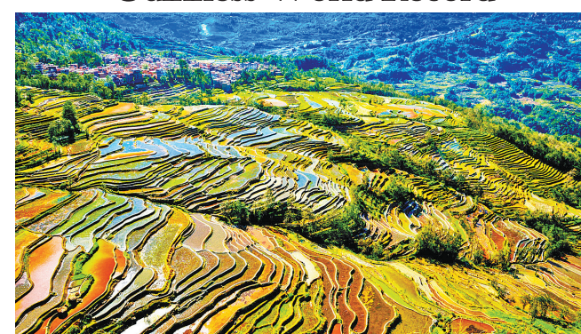
A panoramic view of Samaba terraced fields. Online photo