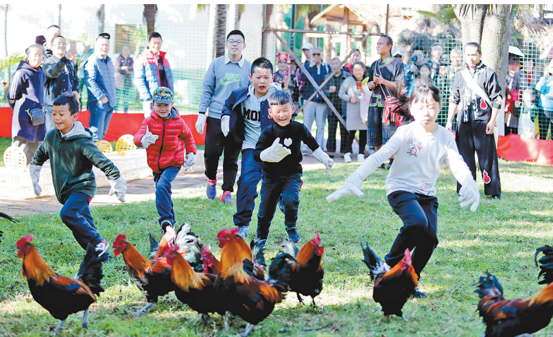
Visitors are dazzled by acitivities in Yunnan Nationalities Village.