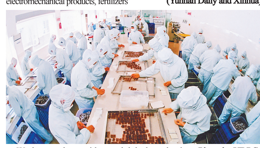
Workers are busy with mouthdoleak production.