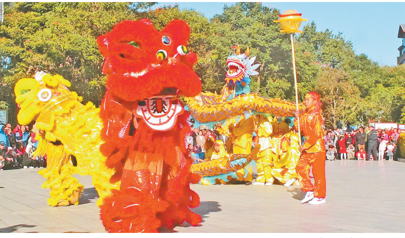
The Dragon Dance highlighted Chinese New Year.

Today, The Spring Festival has already become a symbol of China. Whether you are Chinese or not, whether you are in China or not, you can feel the unique taste of China during the Chinese New Year.