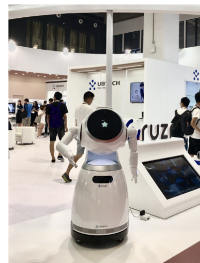
Yunnan made cruzr robot has put into use in Kunming Changshui International Airport. (File Photo)

Last October, industry-leading intelligent robots equipped with facial recognition technology and immediate message features rolled off production lines in Kunming. Together with vehicle-mounted navigation systems, 3D printers, smart terminals, video