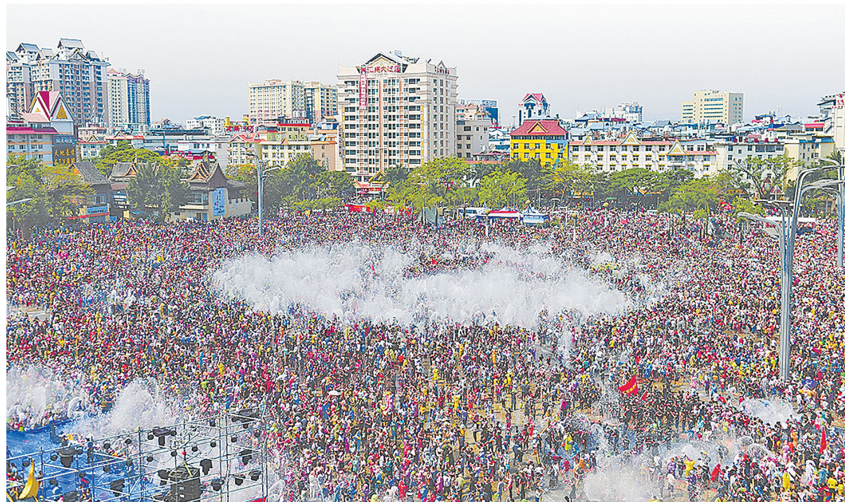
People celebrate the water-sprinkling festival at a square in Jinghong City, Dai Autonomous Prefecture of Xishuangbanna, southwest China's Yunnan Province, April 15, 2018. People sprinkle water to each other to pray for good fortune during the traditional water-sprinkling festival, which is also the New Year festival of the Dai ethnic group.