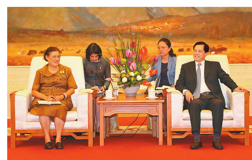
Chen Hao, Secretary of the CPC Yunnan Provincial Committee, talked with Her Royal Highness Princess Maha Chakri Sirindhorn

The bilateral exchanges and cooperation have shown good momentum in trade, tourism, friendly cities, industry and culture