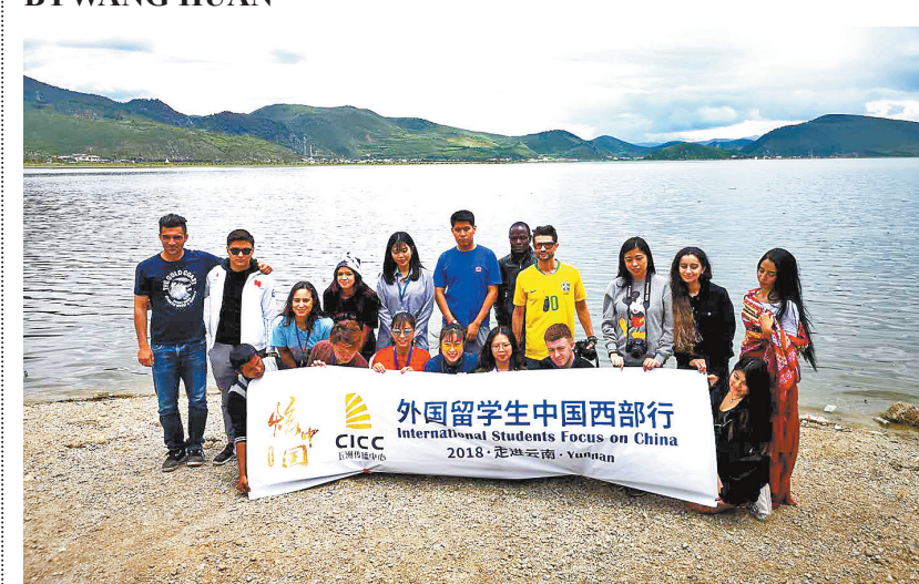
International students visited Napa Lake in Diqing, northwest Yunnan

"Wow! What a beautiful lake!" When the international