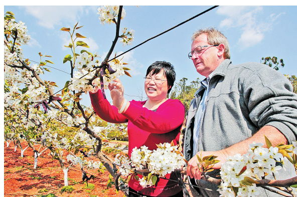
The foreign expert is sharing experience in red pear planting in Anning city, Yunnan