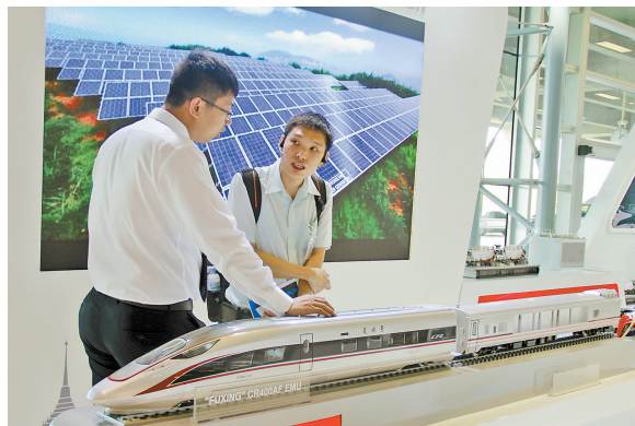
A model of China's Fuxing bullet train is seen during the Rail Asia Expo & RISE Symposium 2018 in Bangkok, Thailand, on March 29