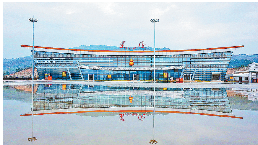
In 2017, Jingmai airport was put into operation, Lancang County, Westsouth Yunnan Province