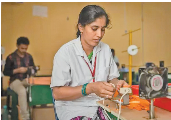
Indian workers are weaving ribbons in Yao Ming Ribbon Company in an Indian port city Visakhapatnam