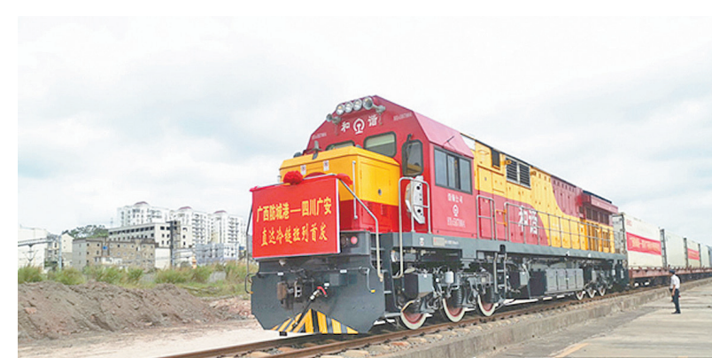
A train loaded with 200 tons of Thailand durians, coconuts and pineapples worth more than 1 million yuan ($148,701) leaves Fangchenggang for Guang'an.

The first cold-chain sea-rail combined fruit transport route linking Thailand with Southwest China via Guangxi Zhuang autonomous region has been launched.