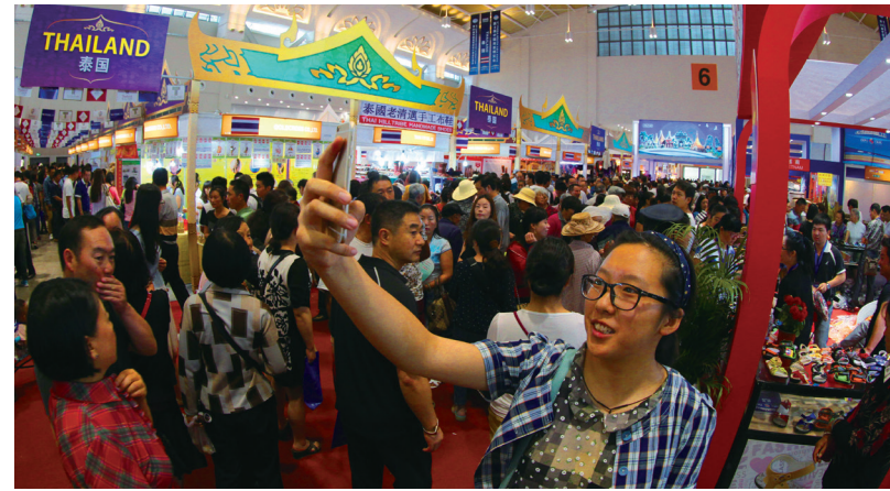
Thailand booths in the China-South Asia Expo are crowded by consumers.

autonomous areas reached 715.586 billion yuan with 37,136 yuan per capita. The revenue of local governments' general public budgets totalled 19,435 billion yuan. There were 484 primary and secondary schools for nationalities in Yunnan province. The number of ethnic minority students in school reached 4.62 million.