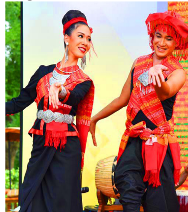
Thai dance performed during the Thailand Day.