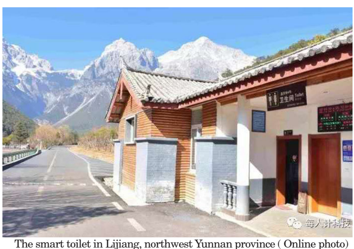
The smart toilet in Lijiang, northwest Yunnan province

In a matter of seconds, Qian Yafen can easily locate the nearest vacant toilet on her cell phone.